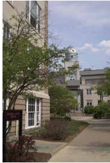
REAMER CAMPUS CENTER AND OLIN CENTER

The ECSI is a set of initiatives focusing on programs, faculty growth, teaching and learning facilities, Diversity, Equity, and Inclusion (DEI), and financial stability and sustainability. One initiative is to bring back the department of Civil and Environmental Engineering. Although the department was discontinued in 2008, recreating it is an important objective of the College.