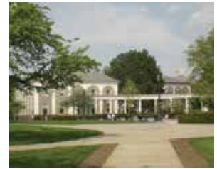
ROGER HULL PLAZA